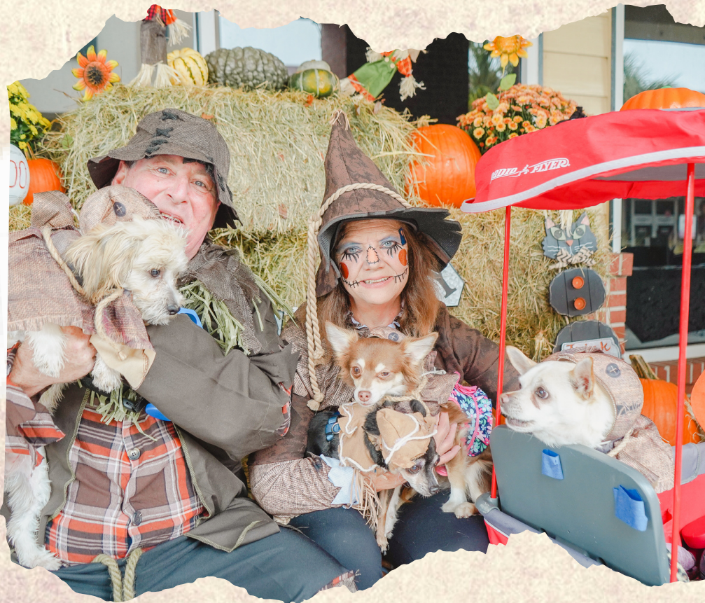
In - Person Fundraising Events