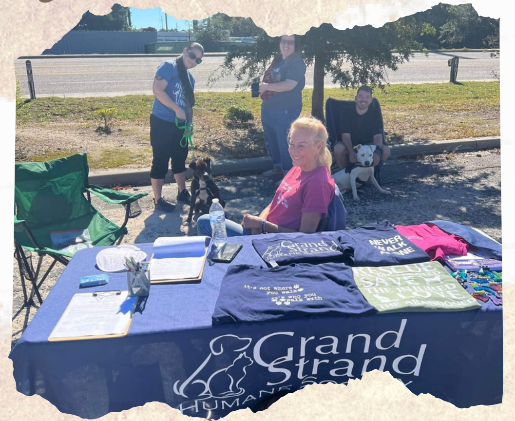
Community Outreach Events