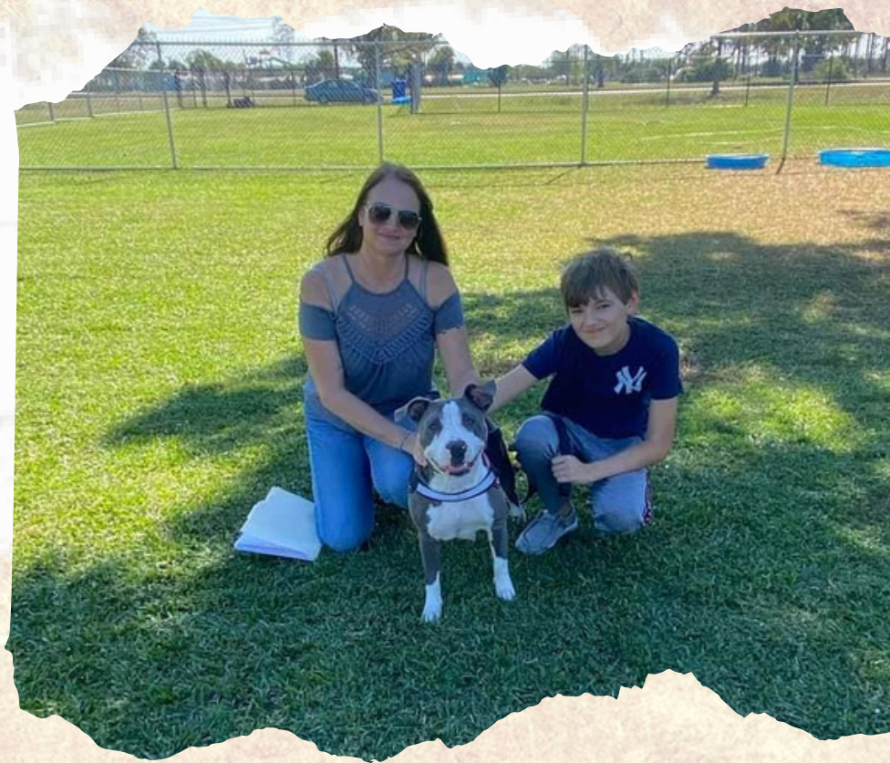
Fee Waived Adoption Events